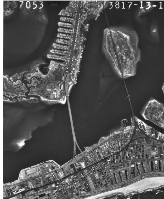
"Special F/X" of Far Rockaway, N.Y.C. Date of Photography: 3-27-84